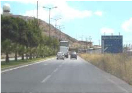
First sign, of not much use

To leave the airport, turn right when exiting the parking lot, then right again at the light. You will take the direction of Rethymno by the highway, the access ramp is on your right.