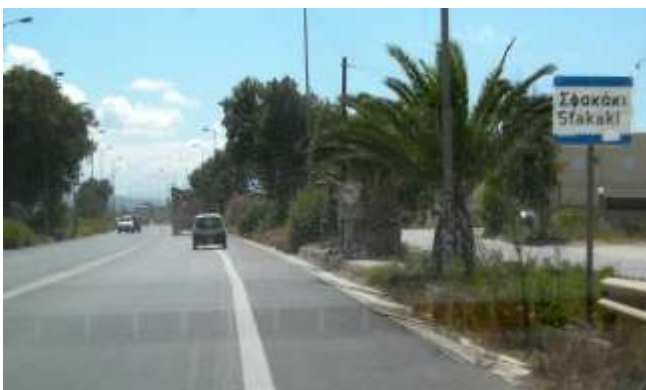
First sign indicating the exit, in Greek

There are exactly 72,2 km from the airport to where you will exit the highway, in SFAKAKI . Starting roughly 1,5 km before this exit, these are the successive signs that you'll see: