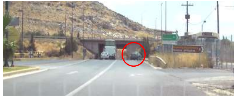
This is the sign showing the right way. Follow the black car!